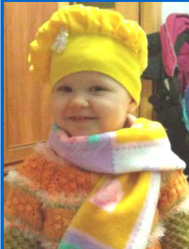
"SOPHIA" FROM THE LORD'S CHURCH IN IVANO- FRANKIVSK, UKRAINE

It is your support that allows me to spend time, energies, and expense in these activities.